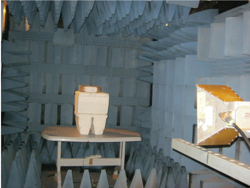
Figure 2. Intermodulated Radiated Emission Test